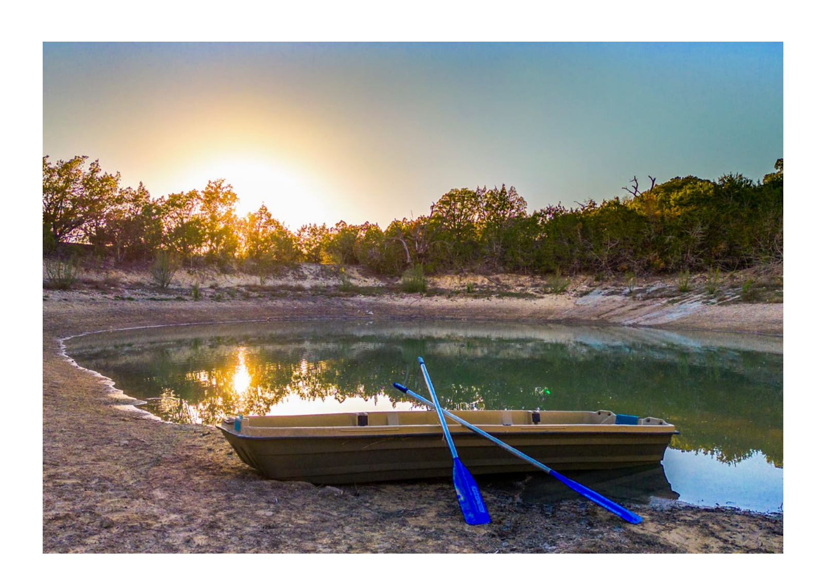
\pm 43 Acres